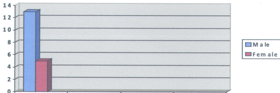
Graph 4.1 Sexual Orientation of Participants

The participants totaled eighteen undergraduate students from the northeastern United States college, who were recruited using the SONA system. The experimental group included nine participants while the control group included nine as well. The participants varied on their sexual orientation of which thirteen were males and five were females (see graph 4.1). Participants varied in age, in which they identified ages; 18-20 (11), 21-24 (3), and 25-28 (4).